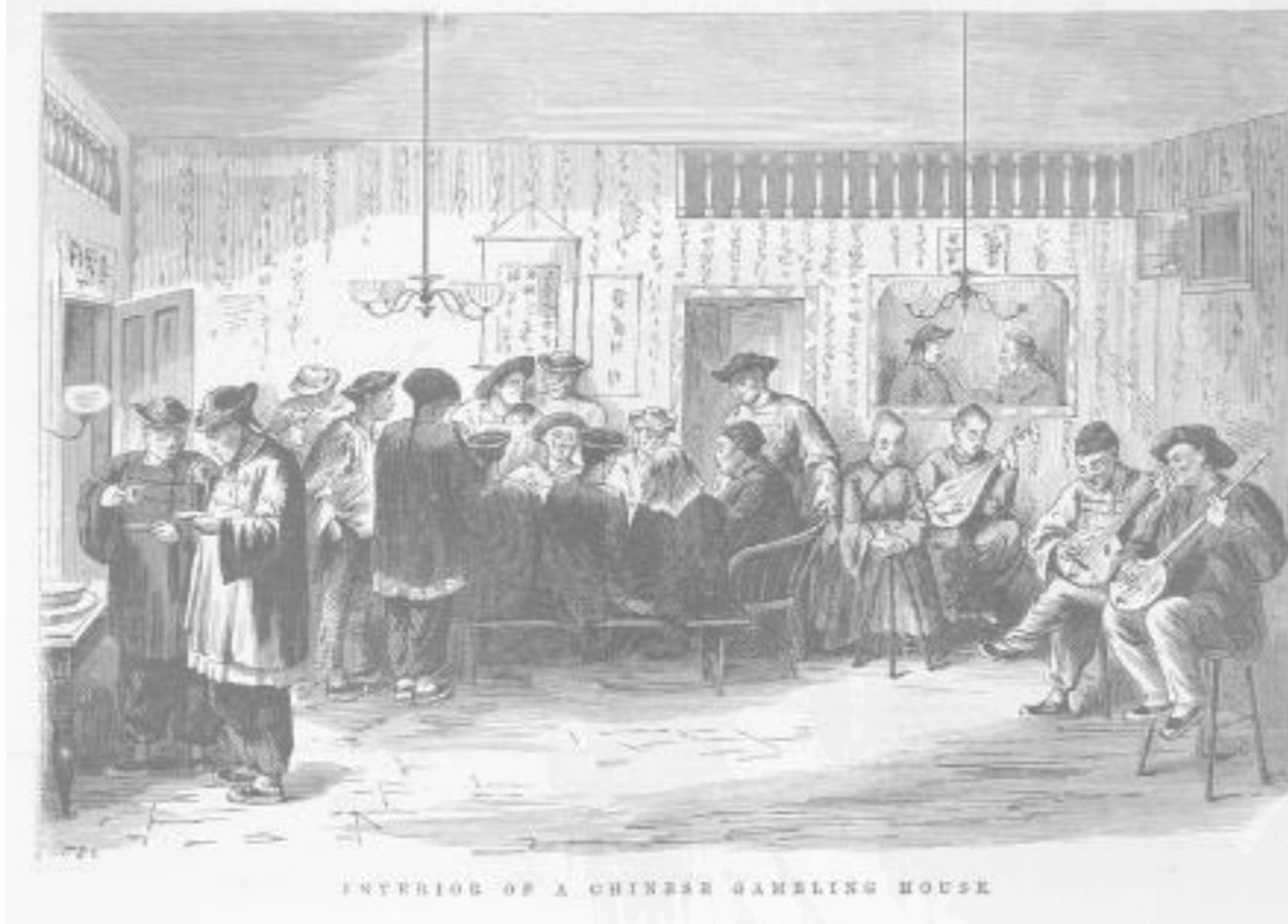
Interior of a Chinese gambling house, 1871. Wood engraving published in the Illustrated Australian News for Home Readers.